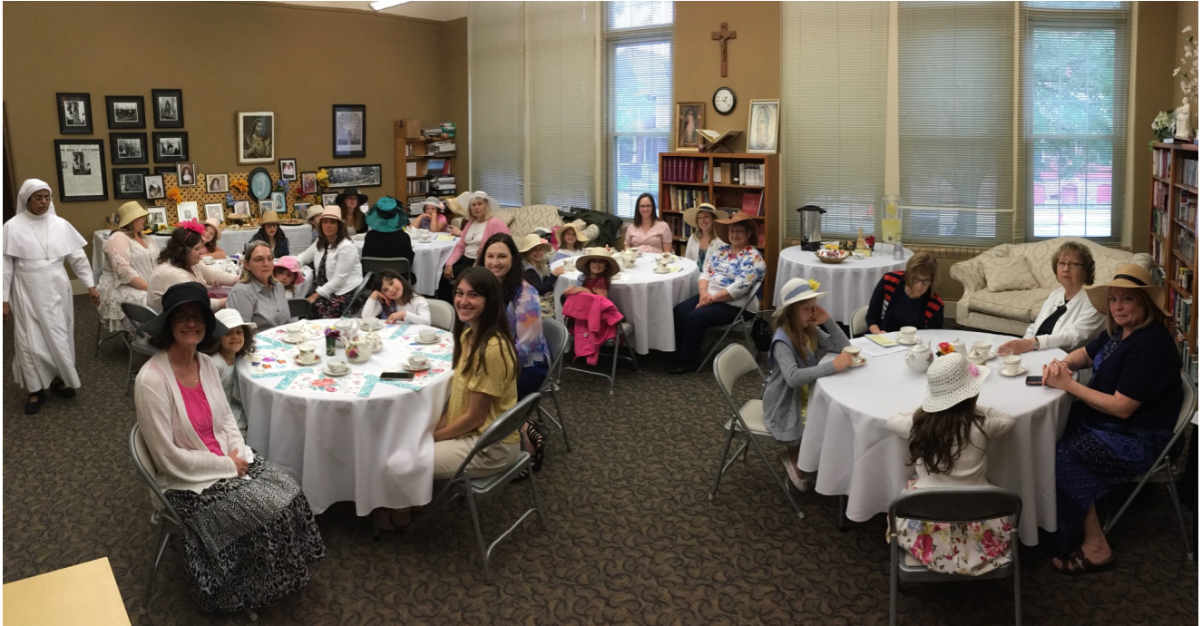
Little Flower's Mother Daughter Tea on Mother's Day!